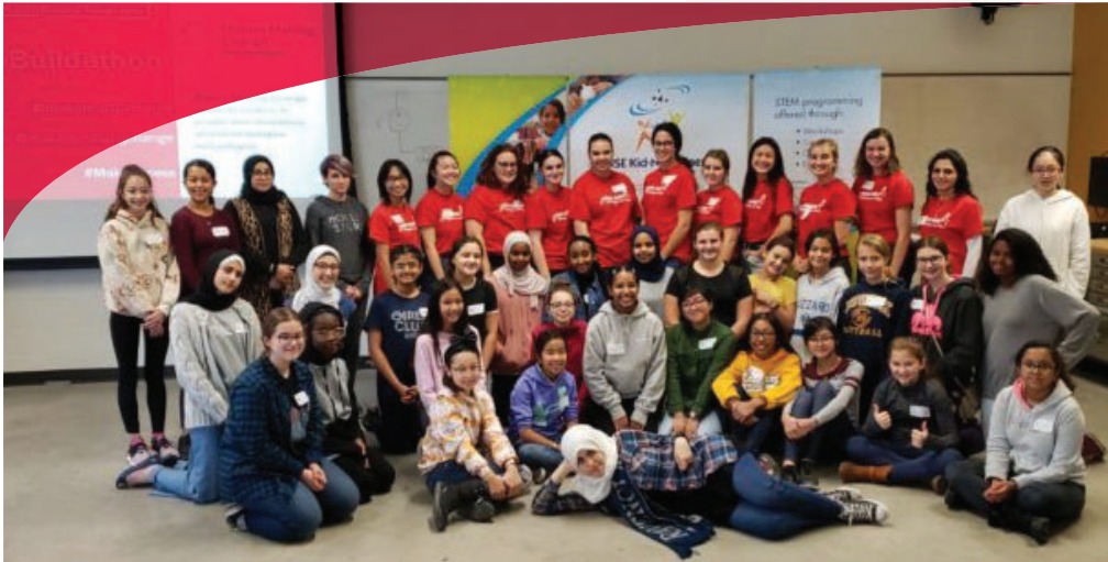
October 19, 2019 Go Eng Girls LipSync Build Participants