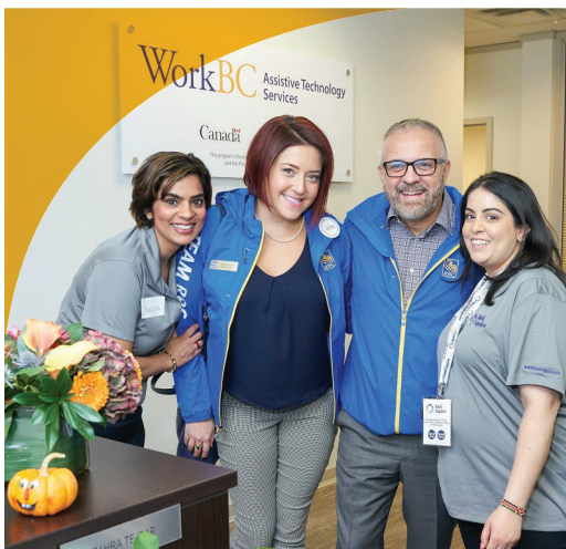
October 17, 2019 Neil Squire staff with RBC volunteers at After Hours Mixer

We were joined by Burnaby area small business owners and local professionals who learned about the work we do and to see some of our innovative assistive technologies.