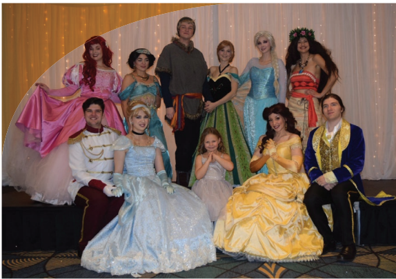
November 23, 2019 Winter Wonderland Princess Ball

November 23, 2019: Neil Squire's Prairie Regional Office hosted their inaugural Winter Wonderland Princess Ball. The fundraising event was a resounding success.