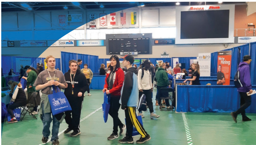
April 8, 2019 Job Fair For Persons with Disabilities

April 8, 2019: Our 10th annual job fair for people with disabilities took place in Regina, Saskatchewan and was a resounding success! Approximately 200 people attended, and we had 48 booths ranging from Crown corporations, Government agencies and non-profit organizations.